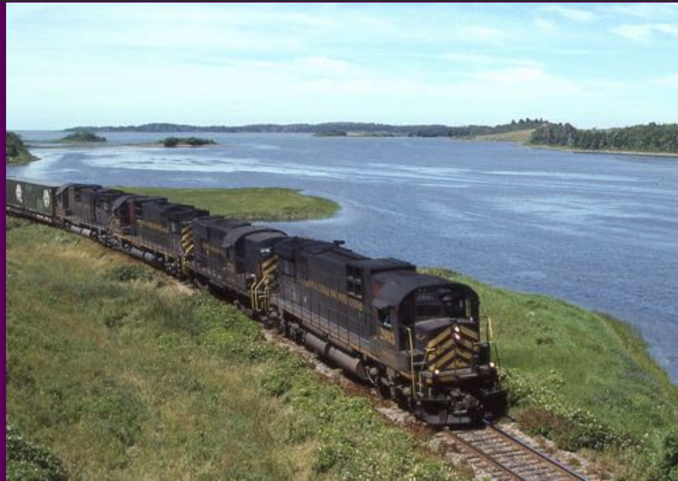
Cape Breton & Central Nova Scotia #2003 (ex-CNR #2003) at Grand Tracadie, Nova Scotia on 26 July 1997. (Bill Linley)