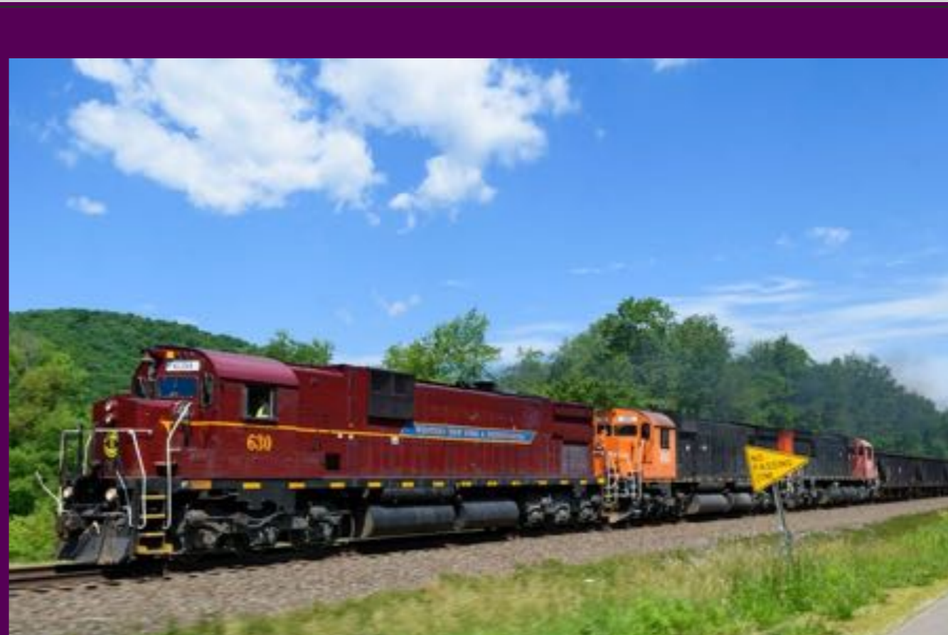
WNY&P #630 at Port Allegheny, PA