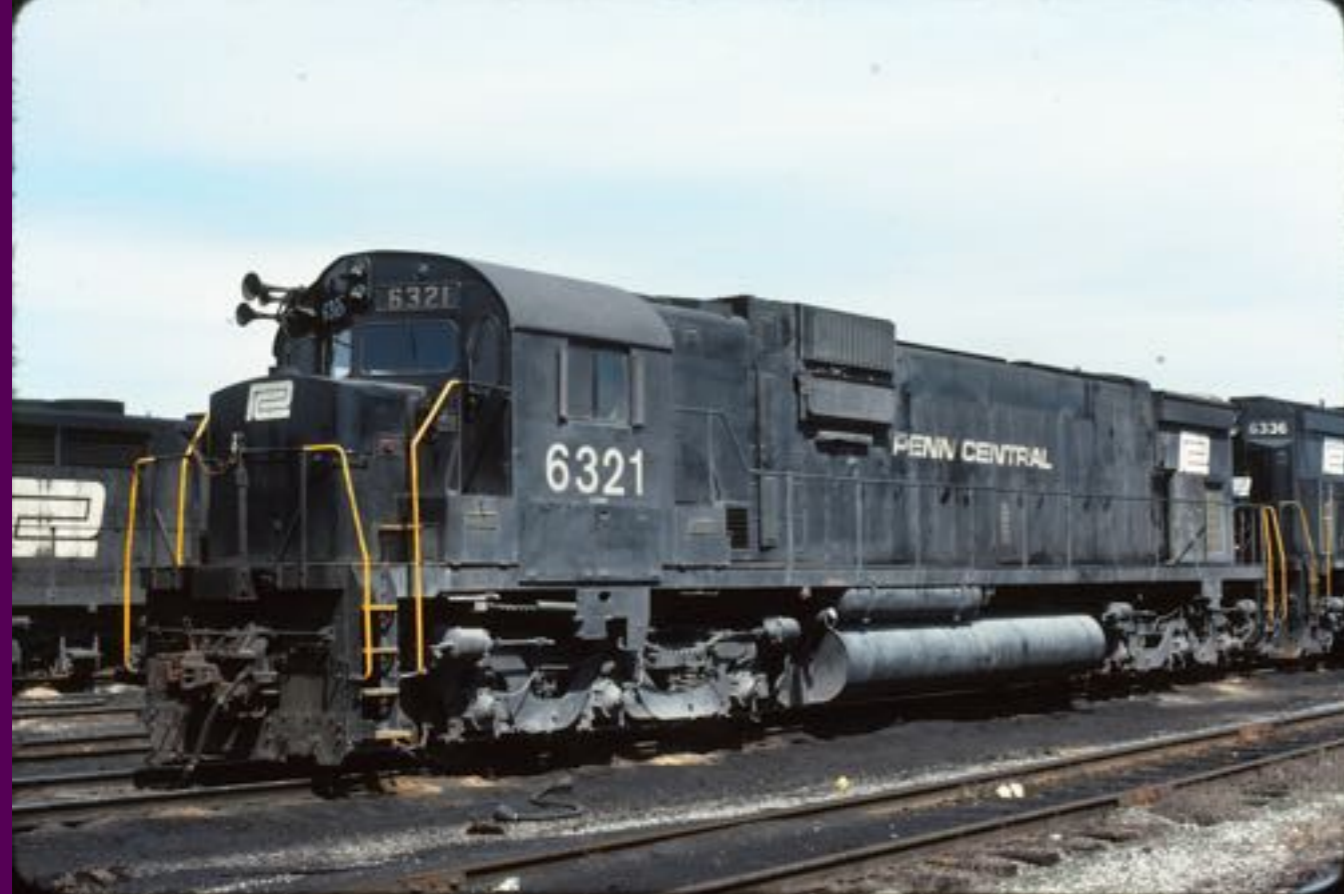
Penn Central #6321 (ex-PRR #63221) at Frontier Yard in Buffalo, New York on 12 April 1976.