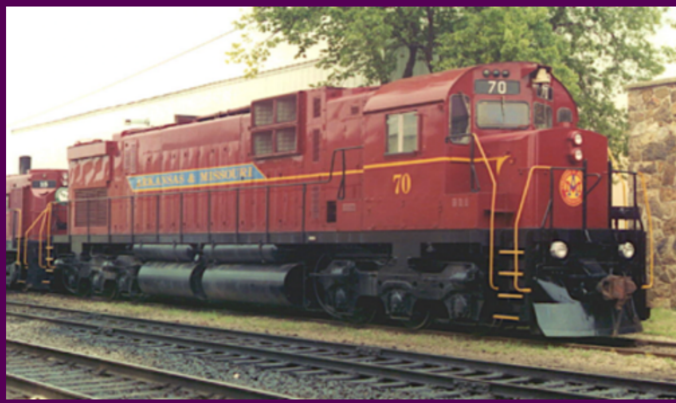
Arkansas & Missouri #70 (ex-CPR #4500)