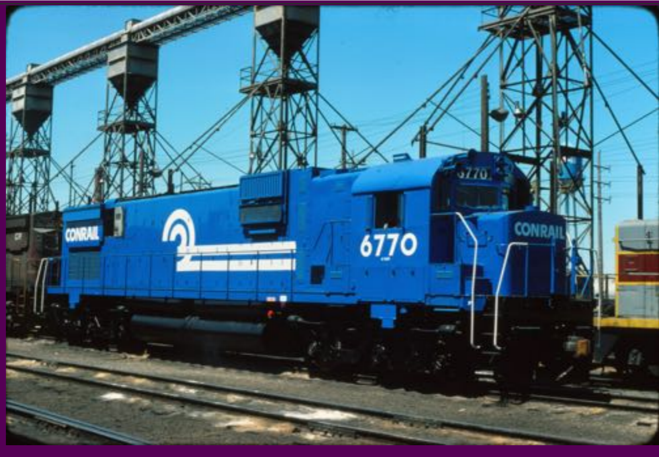
Conrail #6770 (Penn Central #6320 < nee PRR #6320) at Collingwood, Ohio on 9 May 1977.