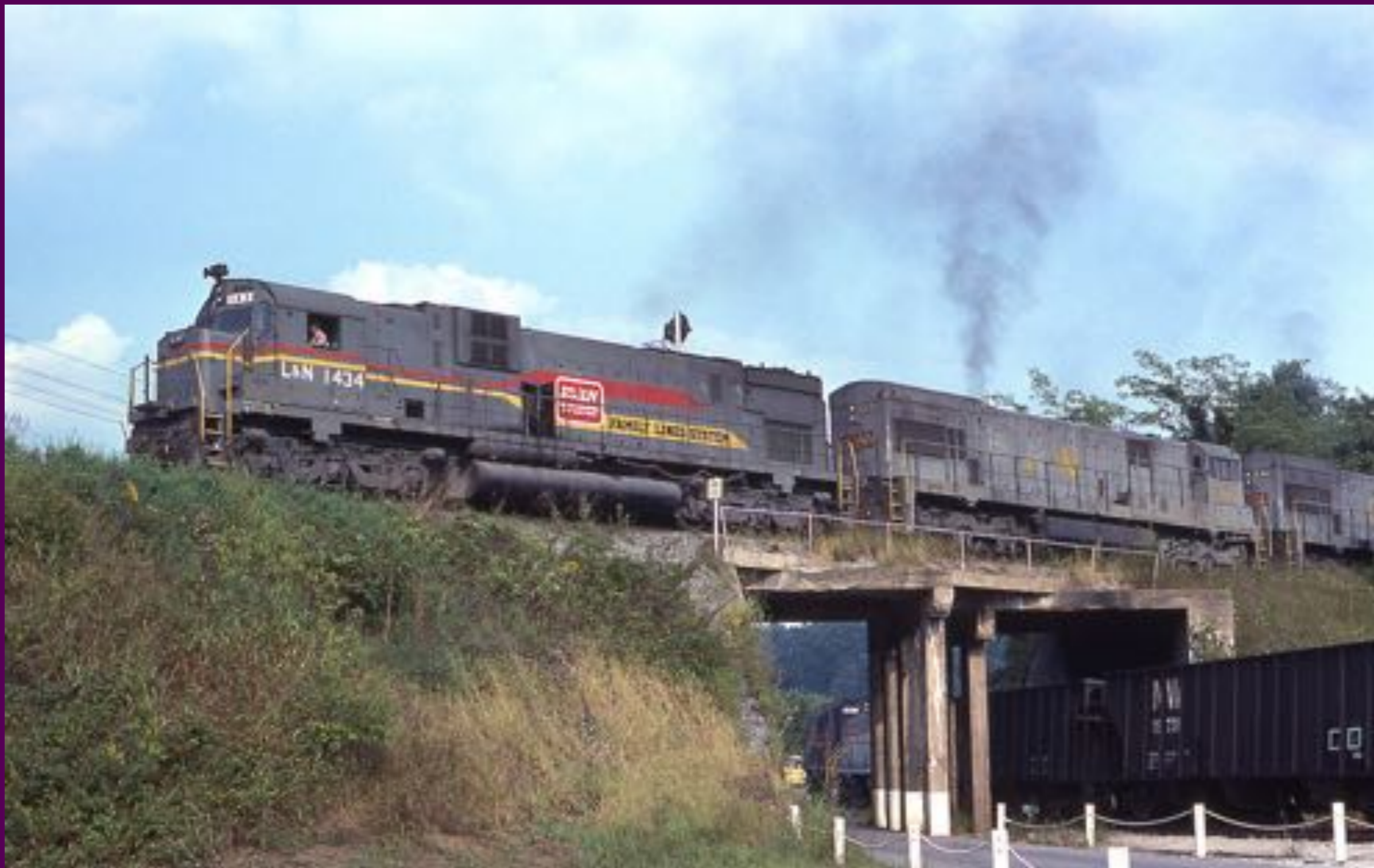
Family Lines (Louisville & Nashville) #1434 at Corbin, Kentucky