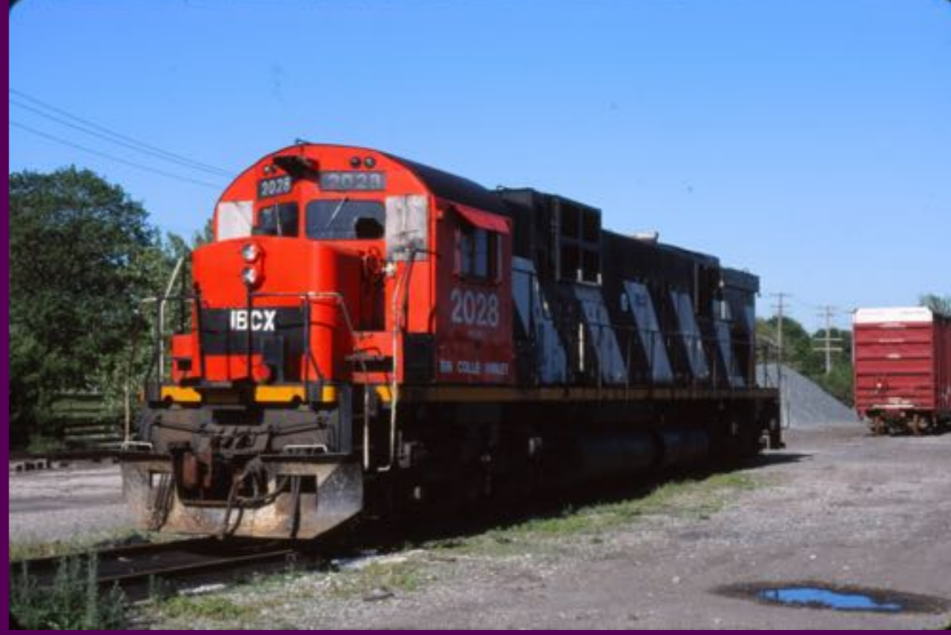
IBCX #2028 (ex-CB&CNS #2028 < nee CNR #2028) at Detroit, Michigan in May 2002.