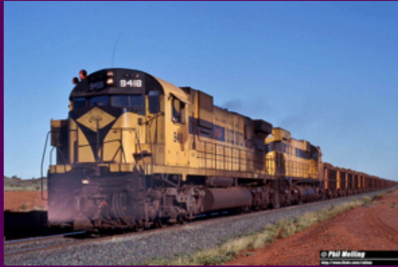
Cliff Robbe River #9418 (ex-C&O 2102) hauling Iron Ore Train Loop 1 in May 1978.