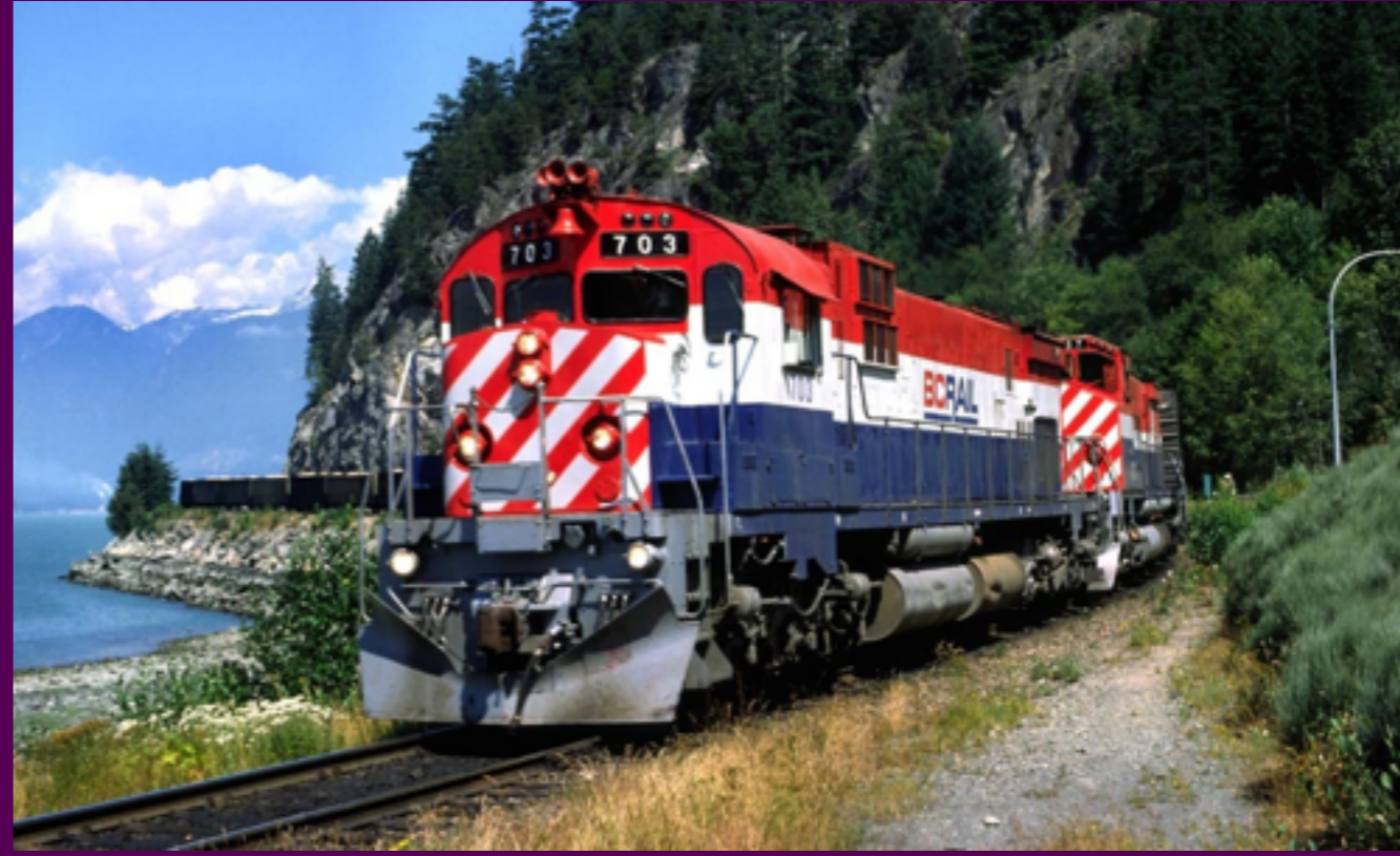
British Columbia Rail #703 (ex-PGE #702) at Porteau British Columbia in September 1988