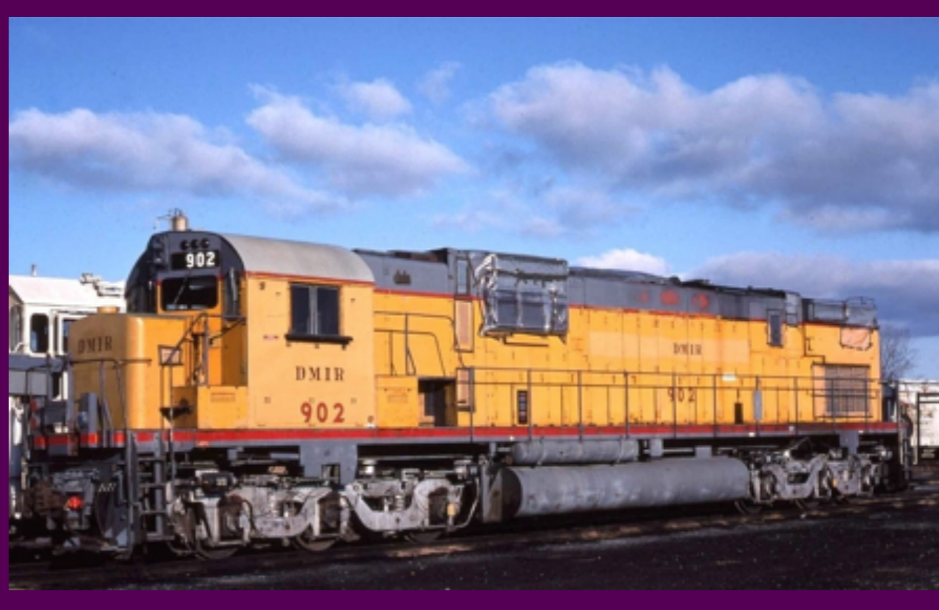
Duluth Missabe & Iron Range #902 (ex-UP 902) at Fond du Lac, Wisconsin on 9 April 1976.