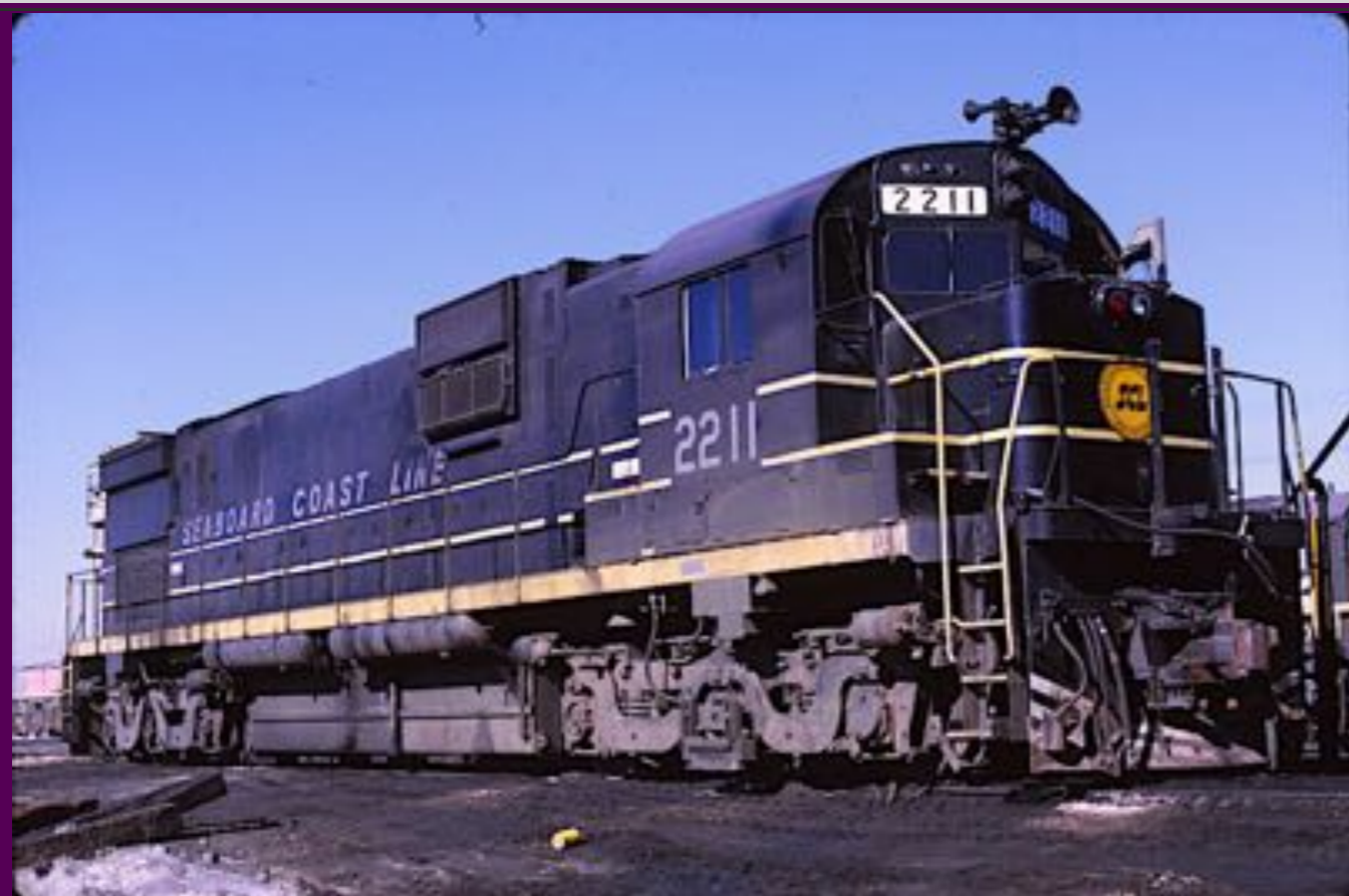
SCL #2211 (ex-ACL #2001) at Waycross, Georgia on 25 January 1970.